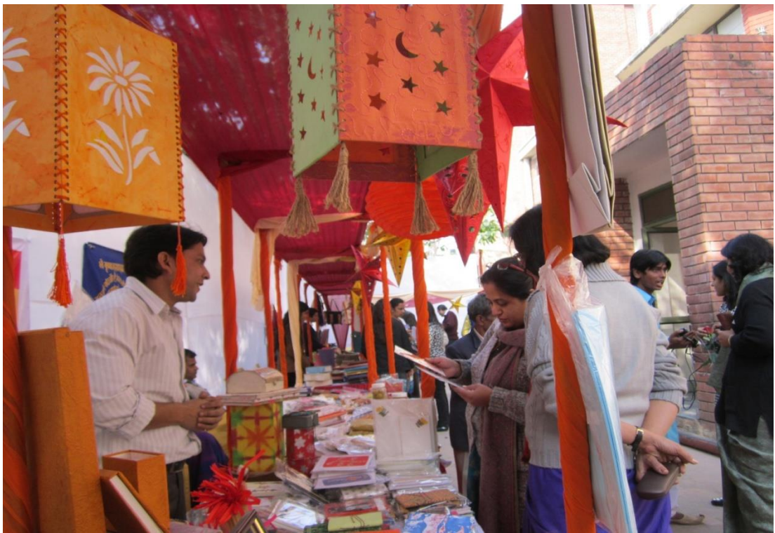
Exibhition of praduct at India Internation trade fare at Pragati Maidan, New Delhi.