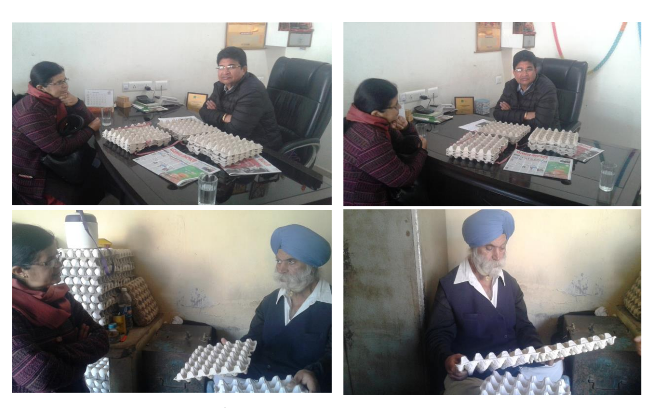
Marketing of Egg Tray at Barvala, Haryana and Panjab