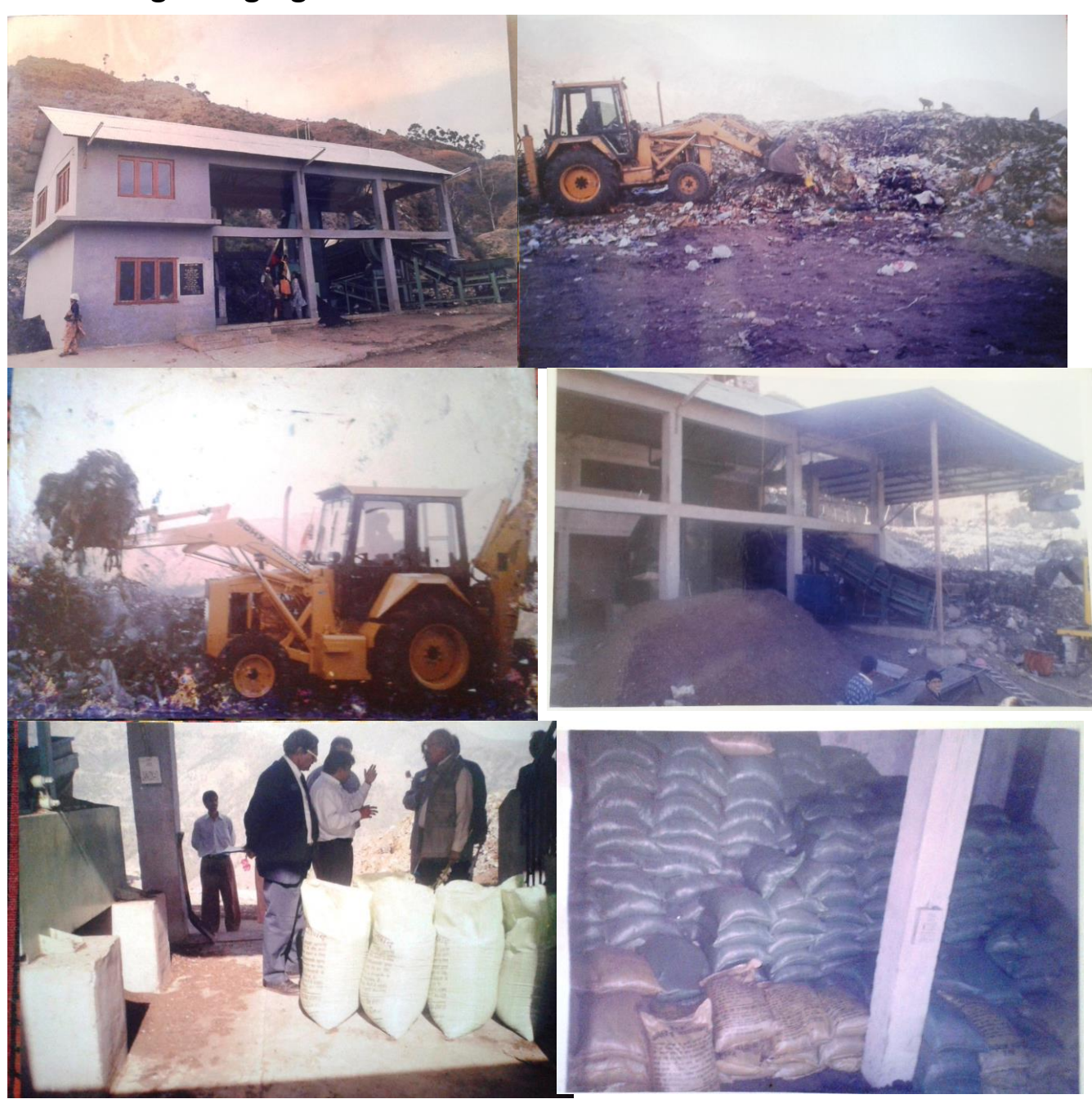
After 14 years of the successful operation of the plant, we have handover this plant to Municipal council solan as per Norwegian embassy (project funder) advice.